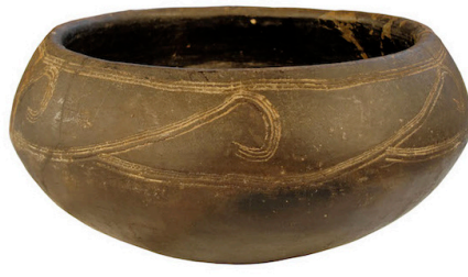
A Choctaw clay bowl, carried to Oklahoma on the Trail of Tears (Choctaw Nation Capitol Museum).

land, as well as the plants and animals there. The respect that early Choctaw people had for the earth is seen in the care and effort that was put into building large earth mounds.