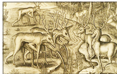
Fig. 2: Depiction of deer stalking by Theodore Debry 1591.

the Choctaw way of life. The indigenous inhabitants of the Southeast acknowledged a profound debt for all that the deer and other animals provided for them. This was expressed through dances