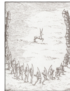
Fig. 3: Depiction of communal hunting Du Pratz 1758.

and other forms of art that honored the animals, and through managing the landscape so that it could support a larger deer population than would be possible naturally. This was done by regularly setting low-intensity wild fires that cleared brush and increased browse for the animals (Denevan 1992:371-372).