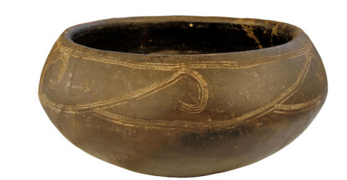
A Choctaw clay bowl, carried to Oklahoma on the Trail of Tears (Choctaw Nation Capitol Museum).

land, as well as the plants and animals there. The respect that early Choctaw people had for the earth is seen in the care and effort that was put into building large earth mounds.