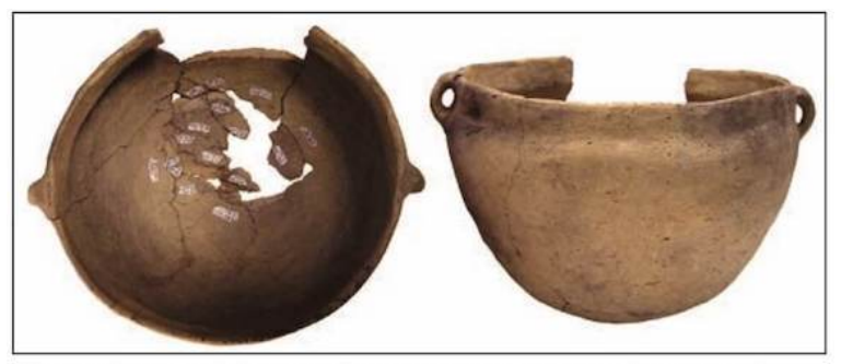
Figure 2: A cooking pot from Lubbub Creek, found with hickory nut shells in it.